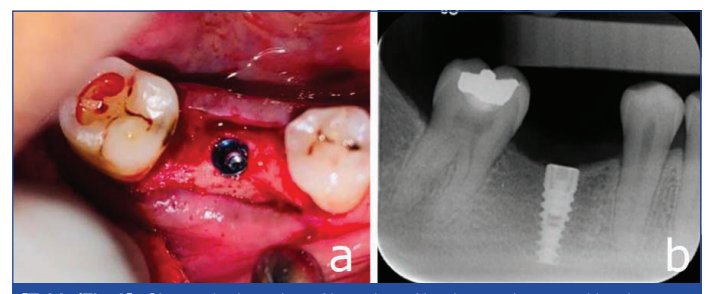
[Table/Fig-3]: Shows the insertion of insertion of implant at the crestal level; a) clinical image b) radiographic image.

The measurements were recorded in buccal, lingual, mesial, and distal directions, and the average values were noted. [Table/Fig-3] Implant placed at the crestal level and radiograph showing implant at crestal level. [Table/Fig-4,5] show the final Insertion Torque Values (ITV) as evaluated with a manual wrench and the Resonance Frequency measurements (ISQ) by osstell Mentor<sup>™</sup> respectively.