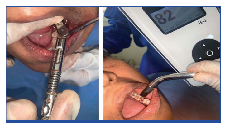
[Table/Fig-4]: Insertion torque value evaluated with torque wrench. [Table/Fig-5]: Resonance frequency analysis (ISQ) with Osstell's mentor. (Images from left to right)